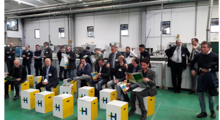
Heidelberg's event design in a customer's print shop.