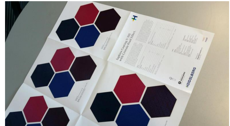
Cristala® Pearl effect print job produced at Mercurio in drip-off printing process with pearlescent effect pigments.