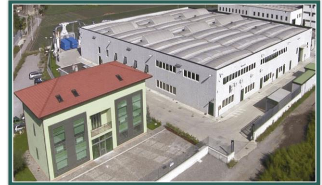
Grafiche Mercurio Spa in Anгри (IT)